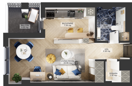
APARTAMENT 1 CAMERA B20 / B34 / B48 / B62 / B76 / B90